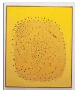
Works by Warhol, Fontana and Koons sold in the seven- and eight-figure range