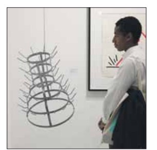
Sturtevant's homage to Ducham

Artists are not the only ones grappling with the legacy of Duchamp's ready